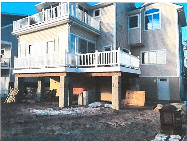
Rear View (1/13/16)