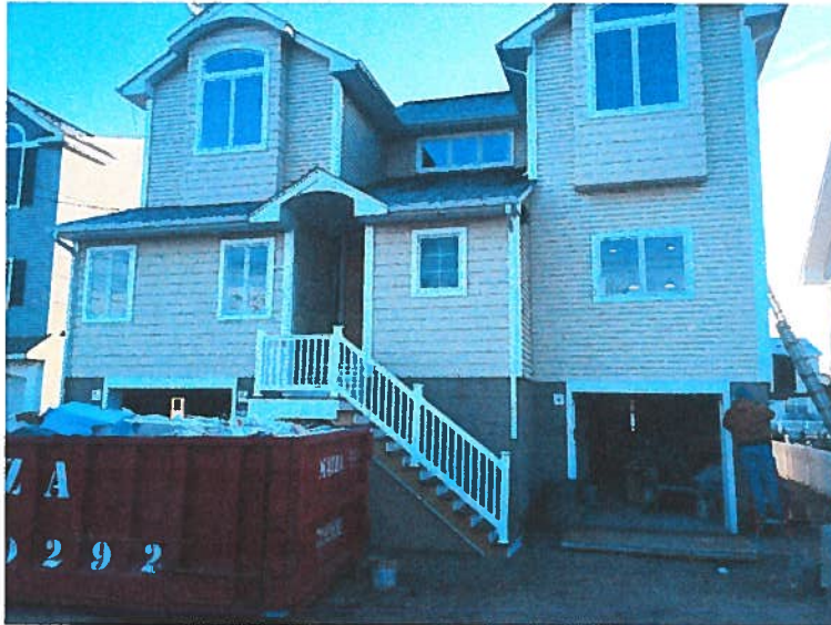
Front View (1/13/16)

If using the Elevation Certificate to obtain NFIP flood insurance, affix at least 2 building photographs below according to the instructions for Item A6. Identify all photographs with date taken; "Front View" and "Rear View"; and, if required, "Right Side View" and "Left Side View." When applicable, photographs must show the foundation with representative examples of the flood openings or vents, as indicated in Section A8. If submitting more photographs than will fit on this page, use the Continuation Page.