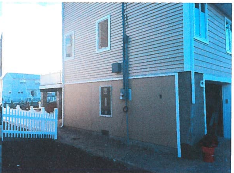
Left Side View (1/13/16)